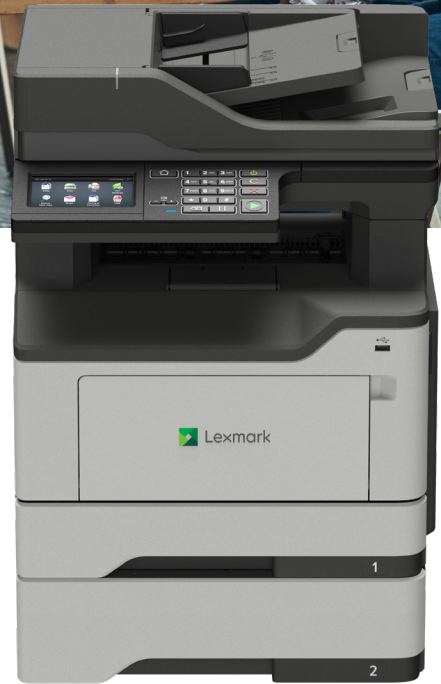
MX421ade with optional tray